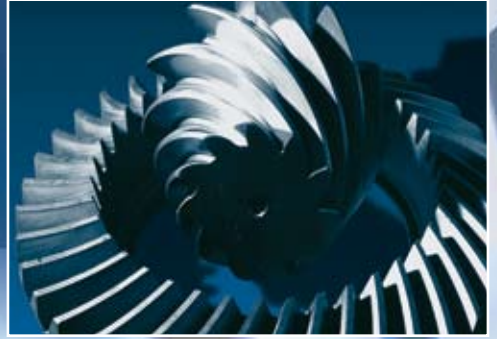
Ring & Pinions