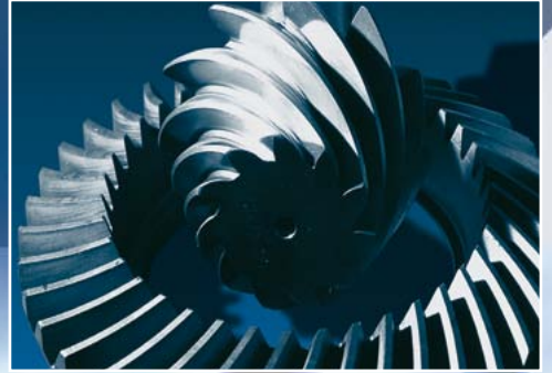
Ring & Pinions