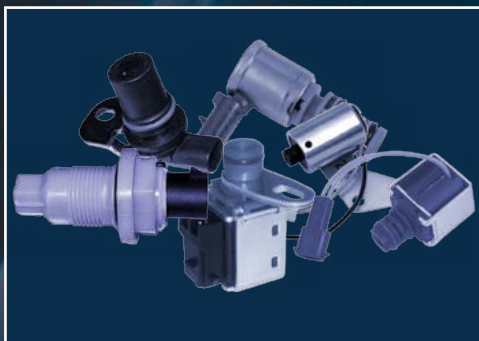
Electrical Components (for Transfer Case Units, Automatic Transmissions, Solenoids)

KING-O-MATIC INDUSTRIES, DIVISION OF TRANSTAR INDUSTRIES INC.