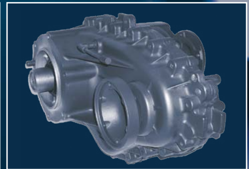
Transfer Case Units & Parts